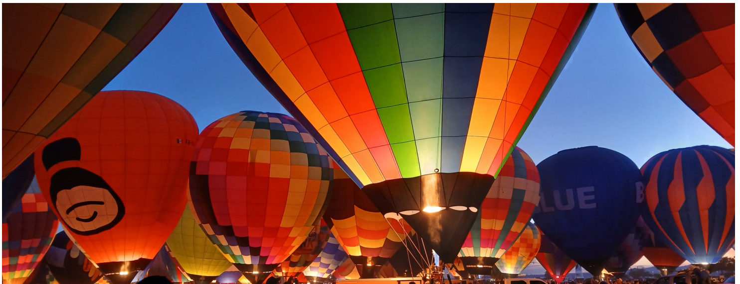
Balloon Fiesta 2024